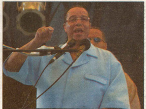
Louis Farrakhan, minister with the Nation of Islam, talks about the importance of knowing your history during his speech.