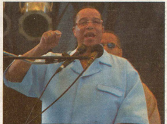
Louis Farrakhan, minister with the Nation of Islam, talks about the importance of knowing your history during his speech.