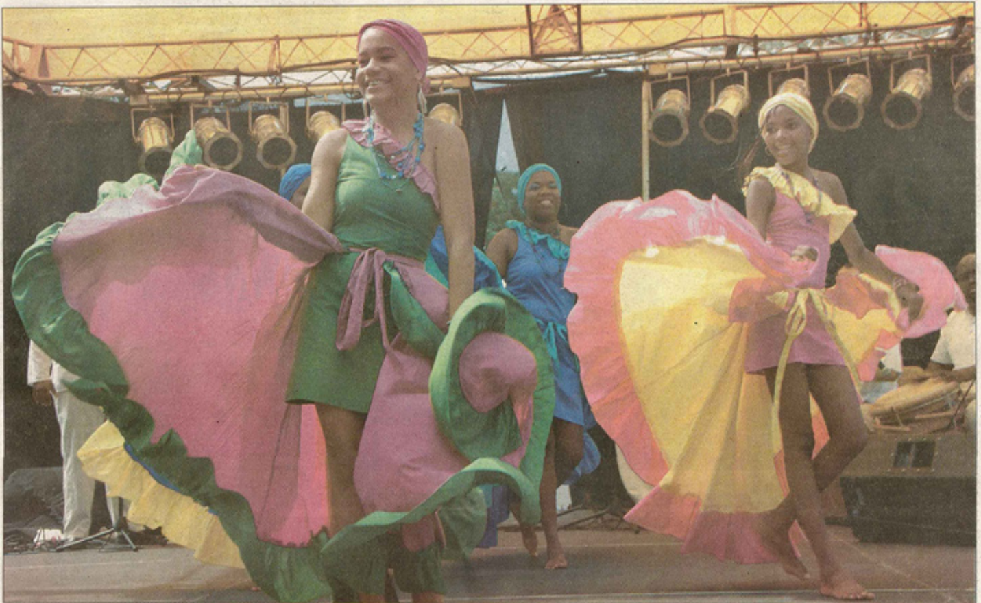
Dancers with Grupo Majestad Negra perform during the Emancipation Day Commemorative Program Thursday in Frederiksted.