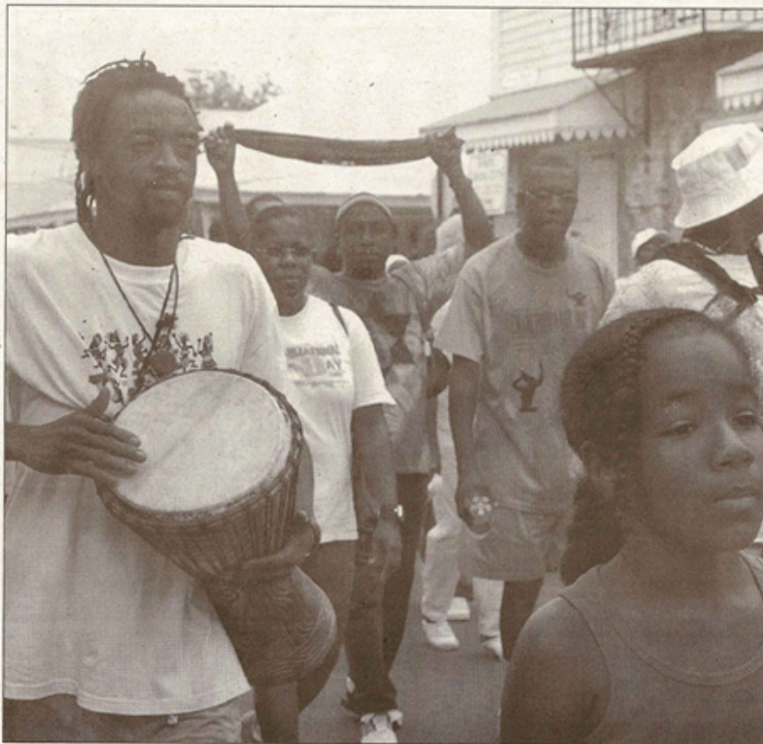
After 14.6 miles walkers enter Frederiksted during the Fort-to-Fort Emancipation Walk.