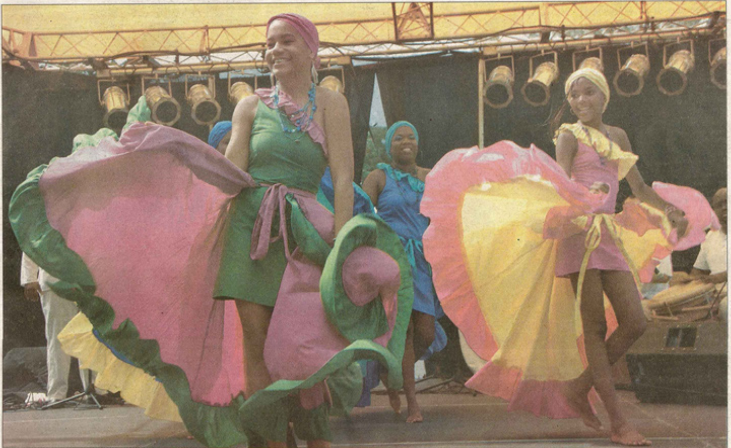
Dancers with Grupo Majestad Negra perform during the Emancipation Day Commemorative Program Thursday in Frederiksted.